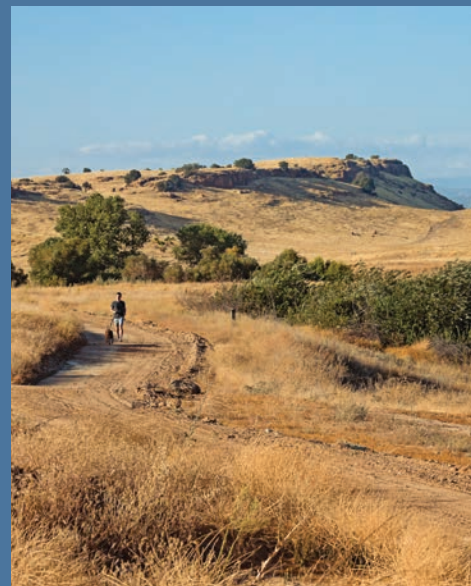
TESORO VIEJO TRAIL

Start your adventure at Town Center and explore a picturesque landscape all the way to the San Joaquin River. The hike begins with a leisurely stroll to Beaver Pond, a perfect spot for fishing. Then it's onward along the creek bed lined with Poplar trees that provide a natural landmark. You'll pass Beaver's House where you can marvel at the beaver dam, Vulture's Rock, a prime location for bird watching, and Kissing Gate, the gateway leading hikers to the serenity of Old Oak Grove with its majestic trees or down to the San Joaquin River.